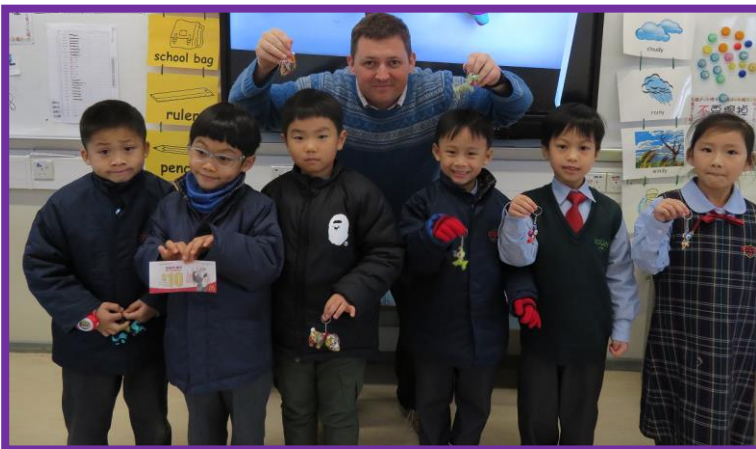
Students from Class 1B showing their prizes

Primary 1 and 2 students who worked hard and behaved well in PLP-R/W lessons this year were rewarded with some great prizes. Students had to get five stars to receive a lucky draw ticket. Several students from each class won animal toys. Many other students won smaller prizes too.